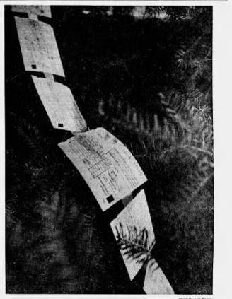
INSTEAD OF POPCORN, CREDIT CARD RECEIPTS Christmas Gifted Means One Santa Rosa Tree