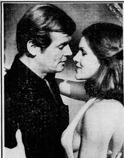
Bond Is Back!