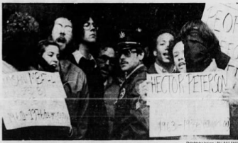
STUDENTS WHO OPPOSE the University of Pennsylvania's having any investments in South Africa demonstrate yesterday as the board of trustees meets to consider the matter. A trustee committee delayed issuing a report on university policy. Story on Page 2-B.