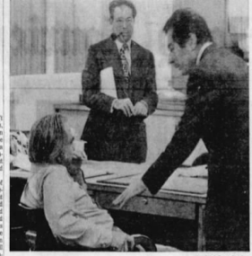
Editors Confer Editors of the New York Times confer on Wednesday in New York City.

At the time of the press conference, Brezhnev said that the talks are progressing and that the agreement reached is a "substantial step" toward a final settlement of the Berlin question.