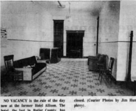
NO VACANCY in the room of the day closed.