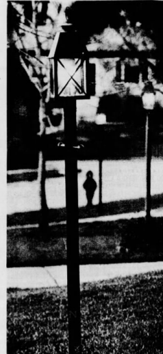
CHAMBERLAIN WATERFOLI. One of about 100 outdoor gas lamps that adorn fountains and ponds in the St. Louis area.