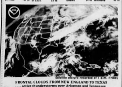
FRONTAL CLOUDS FROM NEW ENGLAND TO TEXAS active thundershowers over Arkansas and Tennessee