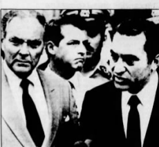
HAIG, LEFT, AND VICE PRESIDENT MUBARAK, RIGHT, met yesterday to discuss U.S.-Egypt ties.

From News-Press Wire Services CAIRO, Egypt — Secretary of State Alexander M. Haig Jr. said today that Egypt is America's "foremost friend" in the Middle East. The statement is a restatement of his earlier statements that Egypt is America's most important ally in the region, and the government of Egypt and the people of Egypt are his most important friends. Haig said that it is not likely to be so in the future. "We're going to have to have a different friend from time to time," Haig added. Haig, who is in Cairo for a two-day visit, met with Egyptian President Hosni Mubarak for an hour Sunday in their second meeting. The secretary arrived Friday as the head of the U.S. delegation to Sadat's funeral.