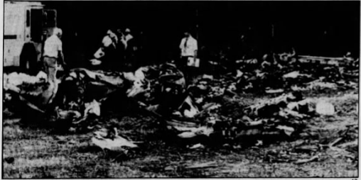
Officials go over scattered wreckage of Midwest Express Airlines jetliner