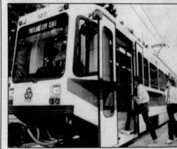
Passengers board Portland's Metropolitan Area Express (MAX)

PORTLAND (AP) — A light-rail car — part of the 700-foot main transit agency's new Metropolitan Area Express (MAX) — derailed in downtown Portland Thursday with a group of reporters aboard.