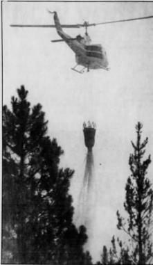
A helicopter drops water on spot fires that jumped the fire line at the Spring Butte blaze southeast of La Pine.

She disappeared from her home at the state highway direction maintenance complex on Interstate 5, Portland.